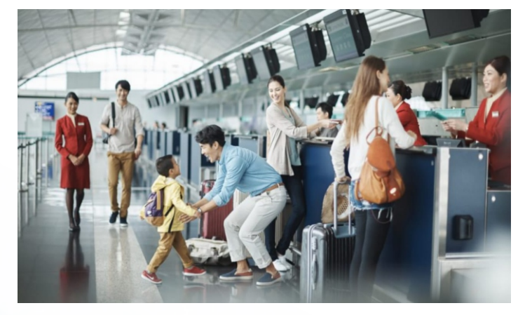
AIRLINE TICKETING AGENT COURSE Duration - 6 Months Minimum Education - 12th Pass